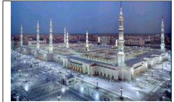
Masjid al-Nabawi in Medina. The mosque also has a tomb of prophet Muhammad and the first two caliphs, Abu Bakr and Umar ibn al-Khattab