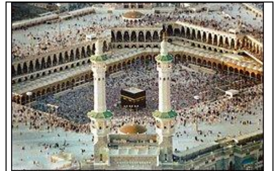
The Pilgrimage to Ka'bah, Masjid al Haram, Mecca (in Saudi Arabia) is one of the five pillars of Islam for Sunnis.